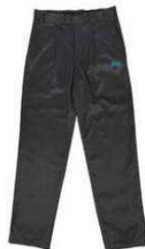
CHARCOAL FORMAL TROUSER