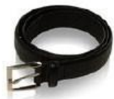
Black / Charcoal Leather Belt