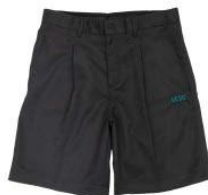
CHARCOAL FORMAL SHORTS