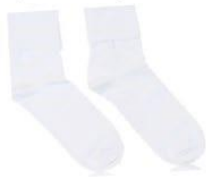
Plain White Visible Socks