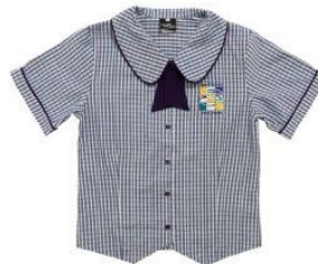
PRIMARY SCHOOL BLOUSE WITH COMPULSORY PURPLE TIE