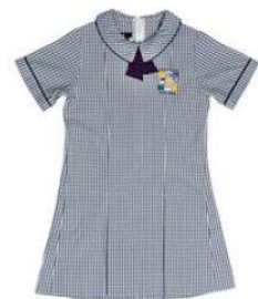
PRIMARY SCHOOL DRESS WITH COMPULSORY PURPLE TIE