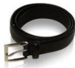
Black / Charcoal Leather Belt