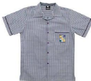
PRIMARY FORMAL SHIRT