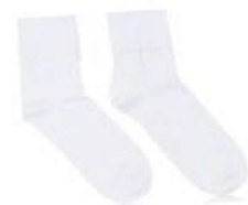
Plain White Visible Socks